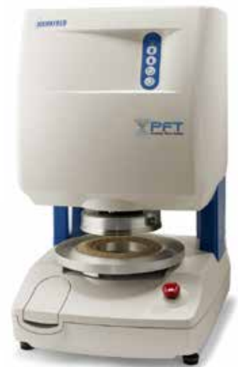
Figure 1: Brookfield Powder Flow Tester with Shear Cell