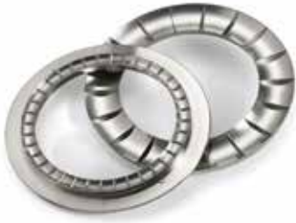
Figure 2: Brookfield Shear Cells

Brookfield Powder Flow Tester is one such instrument that utilizes shear cell technology. Data is provided for flow function, fill and final bulk density, rat-hole diameter, arching dimension, internal friction angle. This data is usually parsed to 3-4 pieces of pertinent information, then used to create an SOP on the material. This SOP is implemented as a guide for creating future batches of material and for in-process QA/QC testing (see figure 2).