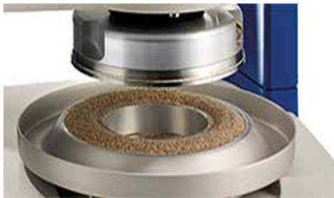
Figure 3: Shear Cell with Powder Sample

Annular shear cells are gaining in popularity for density measurement because they physically simulate what happens to powder when placed in a containment vessel. The cell loaded with powder (Figure 3) is placed on the instrument. A compression plate affixed with a specially designed flat-face lid makes contact with the sample and consolidates the powder to a defined pressure. This action simulates the weight that a container of powder filled to a defined height applies to the material located at the bottom. As the pressure applied by the lid is increased, higher consolidation is achieved and the bulk powder density climbs in value. At test conclusion, the density curve may look like the graph in Figure 4. For reference, the Tap Test described above will very likely report a value that lies somewhere on the density curve as shown.