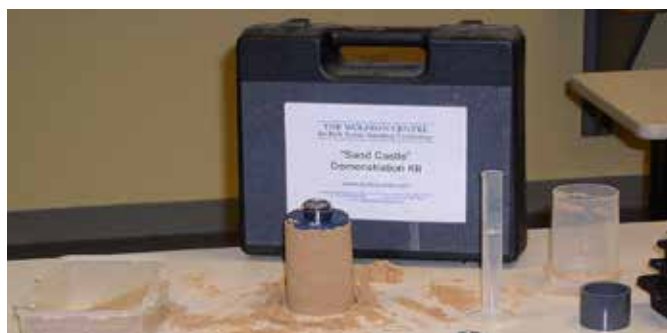
Figure 1: Wolfson Centre Powder Demonstration Kit

Simple tools for assessing compressibility have existed for many years. The Wolfson Centre for Bulk Solids Handling Technology at University of Greenwich in England makes a simple Demonstration Kit for this purpose. Powder is placed into a cylinder so that it completely fills up. The powder is then removed and weighed. “Loose fill” density is easily calculated by dividing cylinder volume into the recorded weight for the powder sample. Individual iron weights of known value are then placed atop the cylinder full of powder. See Figure 1. As more weight is added, the height of the powder column reduces and the corresponding density increase is easily calculated.