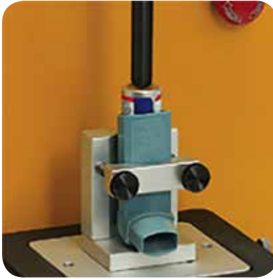
Figure 4: Metered Dose Inhaler Fixture

Inhalers have become a vital tool for people suffering from asthma and other respiratory diseases. Inhalers involve self-administration and as such the dosage expressed must be precise/accurate and reproducible to the lungs or nose. A change in formulation by implementing a new propellant system will ultimately necessitate redesign of the valve system for successful drug delivery. The CT3 can be used in objectively redesigning the valve system and monitoring consistency and functionality of the inhaler.