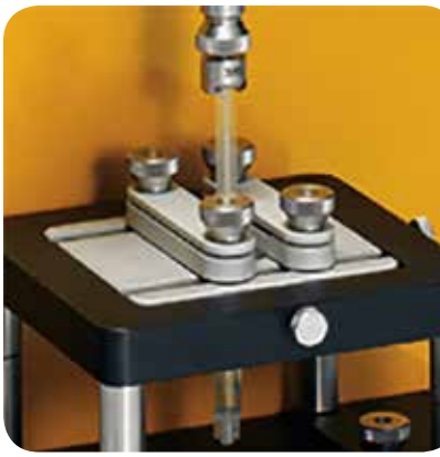
Figure 3: Syringe Test Fixture

Actuation force for the plunger must fall between established limits to satisfy user expectation for acceptable performance. Figure 3 shows a special fixture that holds the syringe in a vertical position beneath the drive mechanism on the Texture Analyzer. A special probe affixed to the Texture Analyzer attaches to the syringe plunger and drives it downward at defined speed through an established distance. This action expels the fluid in the syringe. The Texture Analyzer measures the expulsion force to drain the fluid from the syringe. Pass/fail limits are established by R&D for use in QC. Random syringes selected from each production run are tested in a similar fashion to confirm acceptability.