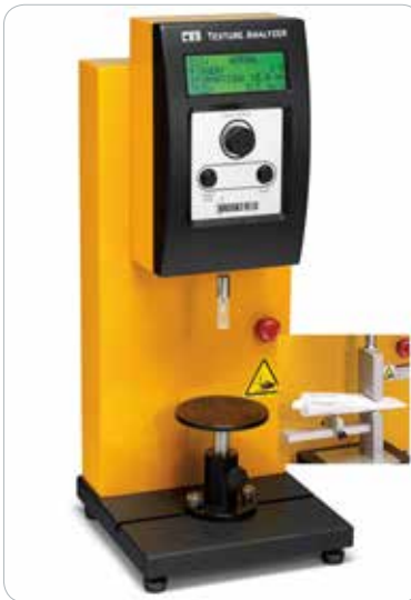
Figure 1: Texture Analyzer with Tube Extrusion Fixture

Products packaged for consumer use by the pharma industry go through a battery of tests related to how the user applies the product. Creams and ointments, for example, are filled into tubes and jars; the effort needed to extract them from their container and spread on skin is the appropriate test. Medicines injected into the body via syringe have variable consistency depending on nature of the formulation; measuring the force needed to expel the fluid from the cartridge is the test that makes sense. Inhalers are designed for various ages of potential users – youth, adults, seniors; the actuation force to trigger flow must not exceed the average customer’s strength, therefore test the plunger.