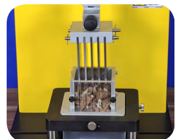
The Kramer Shear Cell

Tensile methods are used for structural assessments of beef or pork using cooked or raw samples. The meat sample is gripped using pneumatic grips and extended in the tensile direction at a set speed during which time the sample is torn apart. The sample can be gripped such that the tensile force is applied transverse or parallel to the muscle fibres. However, as with many test types, the width and thickness of the sample needs to be consistent.