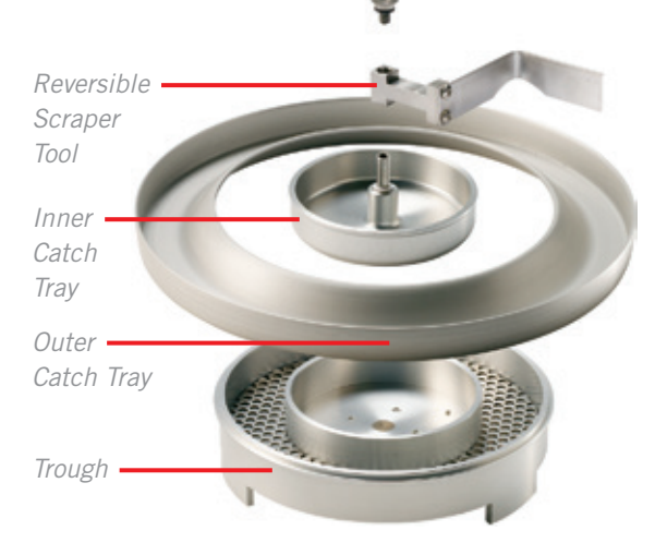
Outer and Inner Catch Trays with Scraper Tool for Sample Preparation in Trough